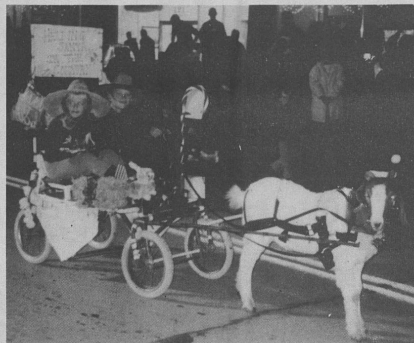
Hudson, the Wonder Goat, and his two companions took Best Overall in Saturday's parade.

Thanks to all who participated and made the parade a success.